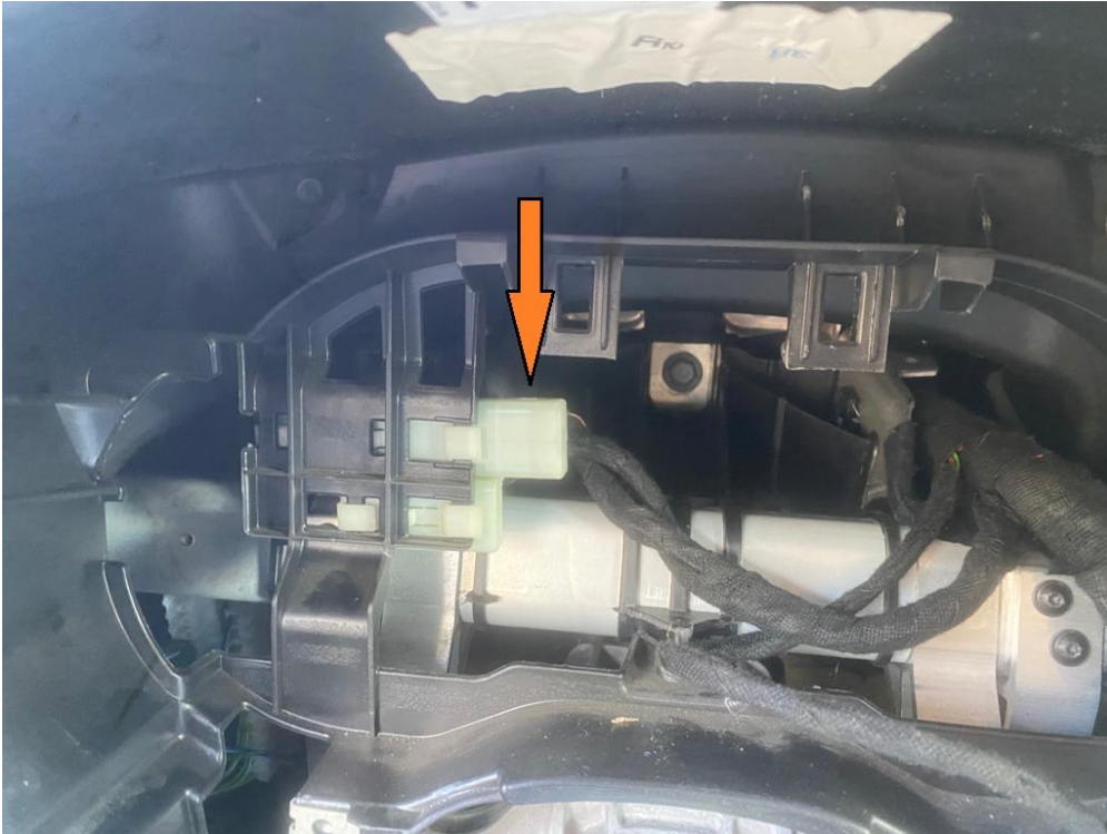
Brown CAN Gate Location

2. Connect Emulator CAN Wirres to Brown CAN Gate